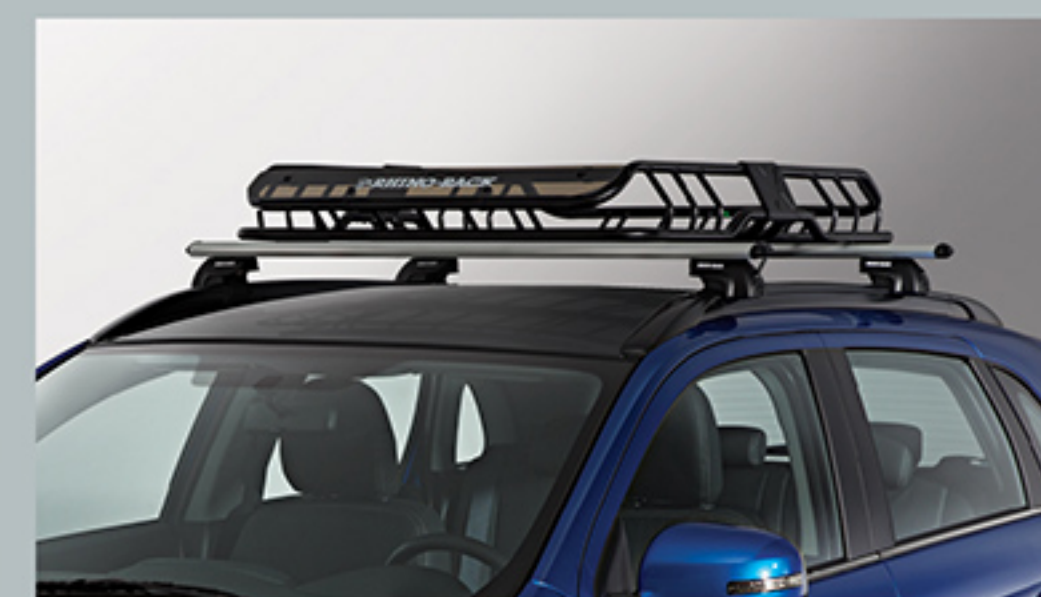
Rhino Rack Roof Rack with Xtray Luggage Basket