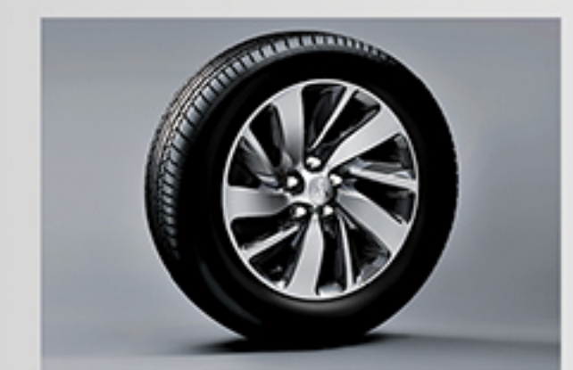
New Design 17" Alloy Wheels