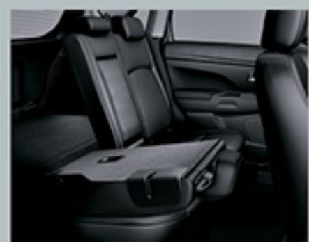
Full-Flat Rear Seat / 60:40 Split Foldable Seatback