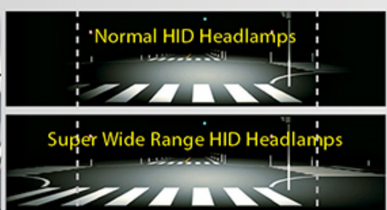
Super Wide Range HID Headlamps for GSR