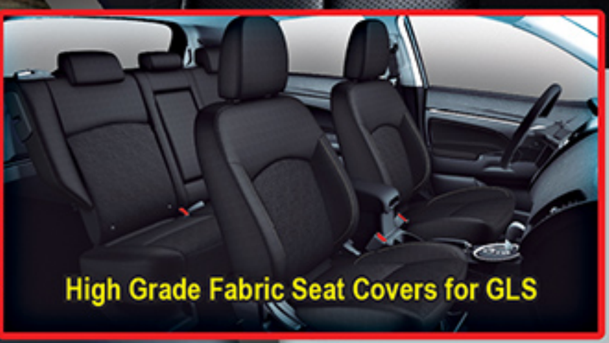
High Grade Fabric Seat Covers for GLS