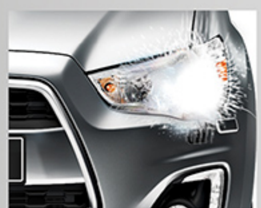
Retractable Headlamp Washer