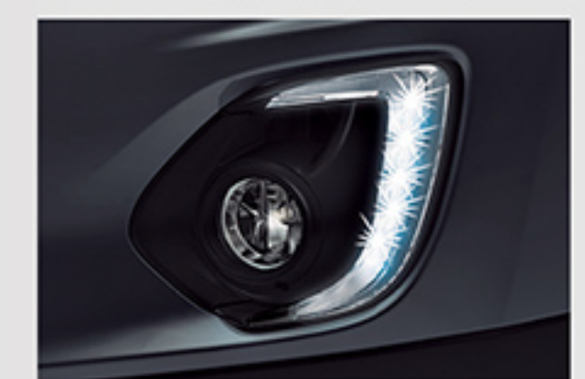
New LED Daytime Running Lamps and Fog Lamps