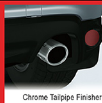
Chrome Tailpipe Finisher

A racing inspired paddle-shift system mounted onto the steering column. They provide the thrill of total control without taking your attention from the road ahead.