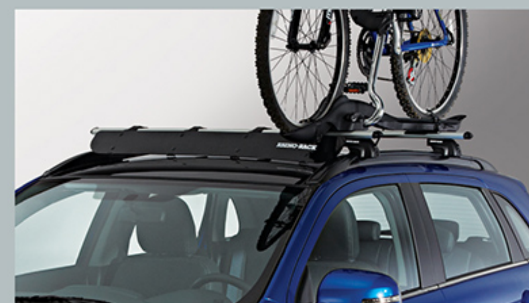
Rhino Rack Roof Rack with Wind Fairing