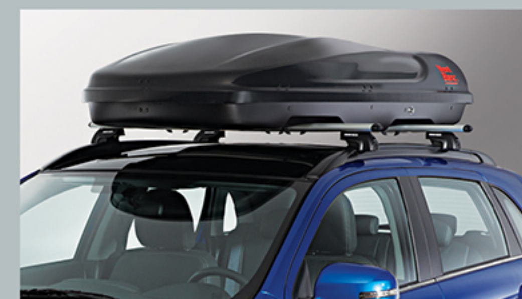
Rhino Rack Roof Rack with Luggage Box

ASX ACTIVE SPORT CROSSOVER Exceed Your Expectations