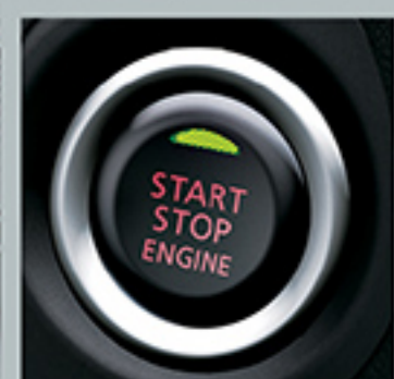
Keyless Operation System