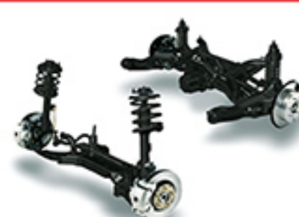
• 4-Wheel Independent Suspension • 4-Wheel Disc Brakes