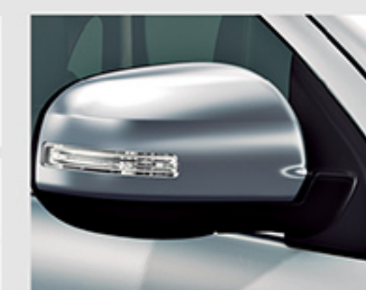
Color-Keyed Power Side Mirrors with Defogger, LED Turn Lamps and Power Fold Function